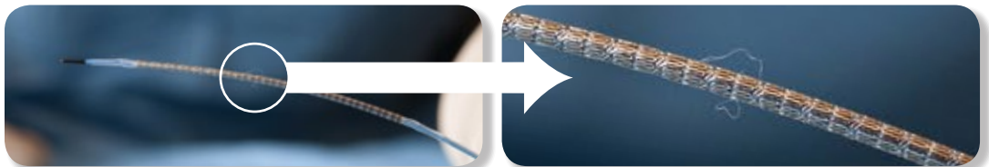
Cotton Gauze Fiber transferred onto a stent by a Glove.